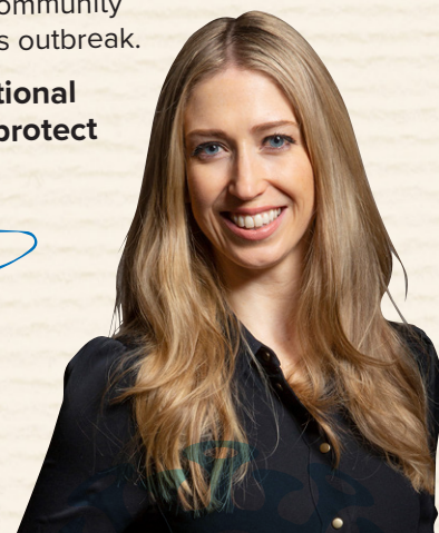
Laura Trott MP for Sevenoaks and Swanley

Please at this time of national emergency: stay home, protect our NHS and save lives.